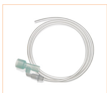
Oxygen and Aerosol Therapy • Respiratory Physiotherapy