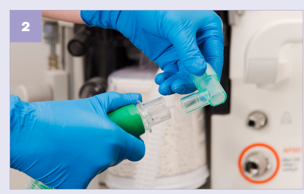
Remove all patient connections.