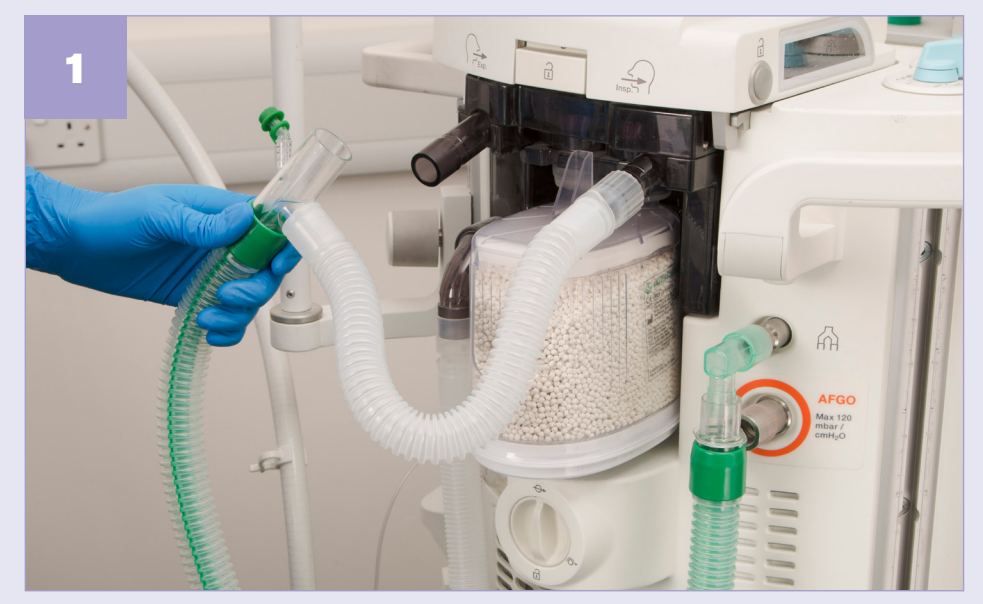
Attach the expiratory limb of the system to a gas flow.