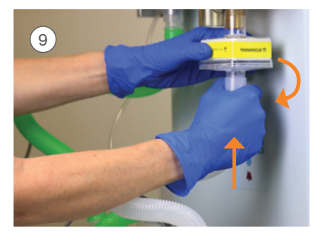
Connect the other end of the return limb to the ventilator . If filtration is required, use the 7-day Air-Guard Clear 7 filter