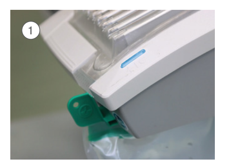
When the fluid collection bag is full the power button will flash blue