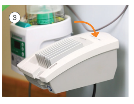
Mount the InterCooler on to the appropriate InterCooler bracket