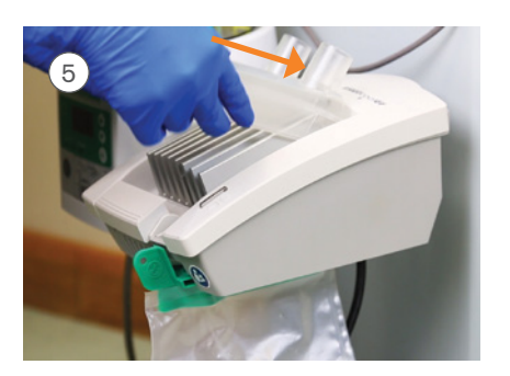
Insert the InterCooler cassette ensuring that the rear edge is located beneath the lip in the InterCooler base