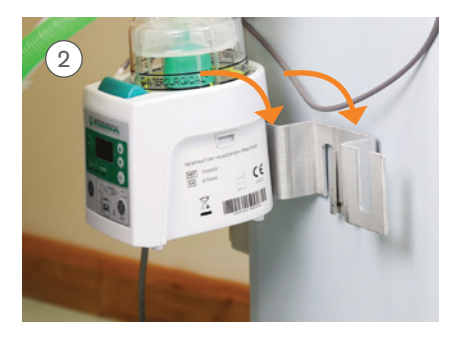
Mount the humidifier on to the appropriate InterCooler bracket

You will need: InterCooler unit, bracket, dual heated wire breathing system and InterCooler adapter kit