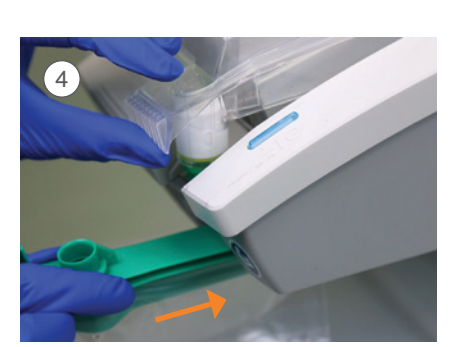
Insert a new collection bag