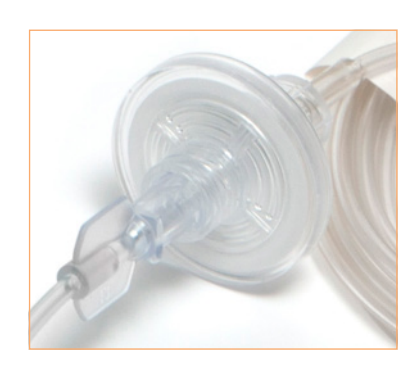
Oxygen and Aerosol Therapy • Variable Oxygen Concentration (Low Flow)