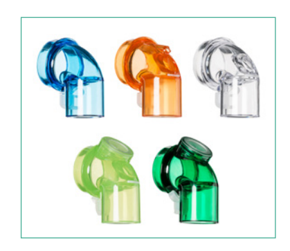
Critical Care • Pulmodyne®