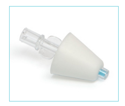
Airway Management • Pulmodyne®