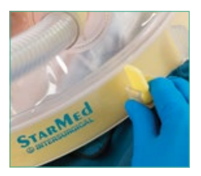
Critical Care • Patient Interfaces • STARMEd